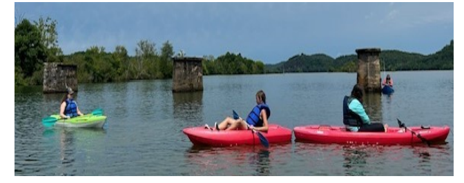
Summer Camp! Watch our promo video at https://youtu.be/4YqKzos21IY